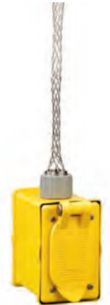
Deluxe Cord Grips (purchased separately)